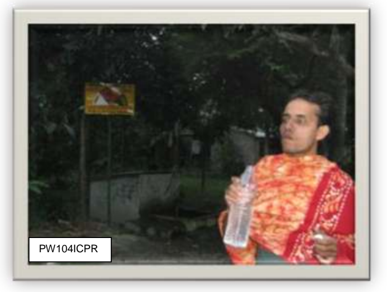
Village report on construction of 25 new dugwells in 2009